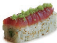
Red Dragon Maki