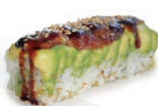
New Alligator Maki