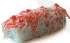
Ocean Crab Maki